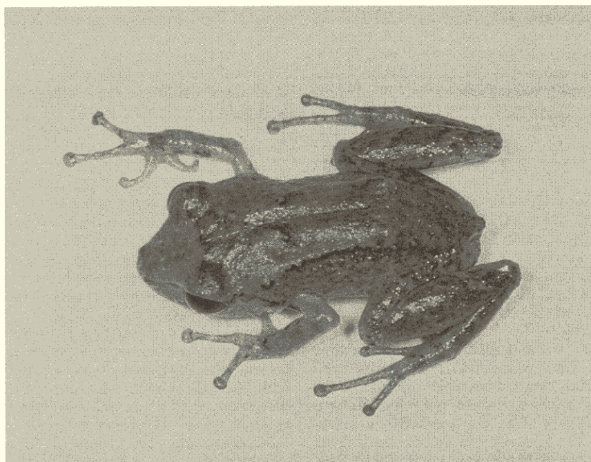
FIG. 1. Eleutherodactylus glamyrus from Pico Real del Turquino, Municipio Guamá, Santiago de Cuba Province, 1974 m.

tance; THL, thigh length; SHL, shank length; and FTW, fingertip (III width). Museum abbreviations follow standardized usage (Leviton et al., 1985), except for MNHNCU, which refers to the collection of the Museo Nacional de Historia Natural, Havana, Cuba; CZACC, Zoological Collection from Instituto de Ecología y Sistemática, Havana, Cuba; and CARE, Collection of Alberto R. Estrada, Havana Cuba.